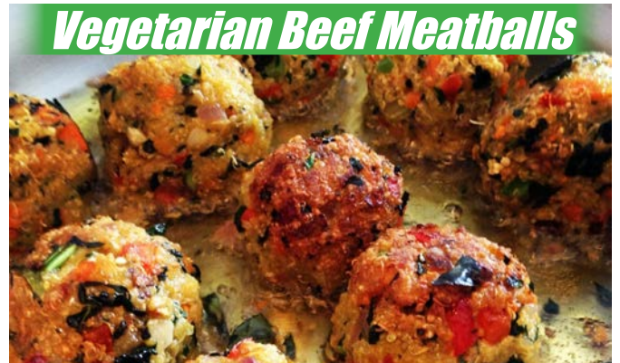
Vegetarian Beef Meatballs