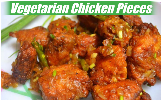
Vegetarian Chicken Pieces