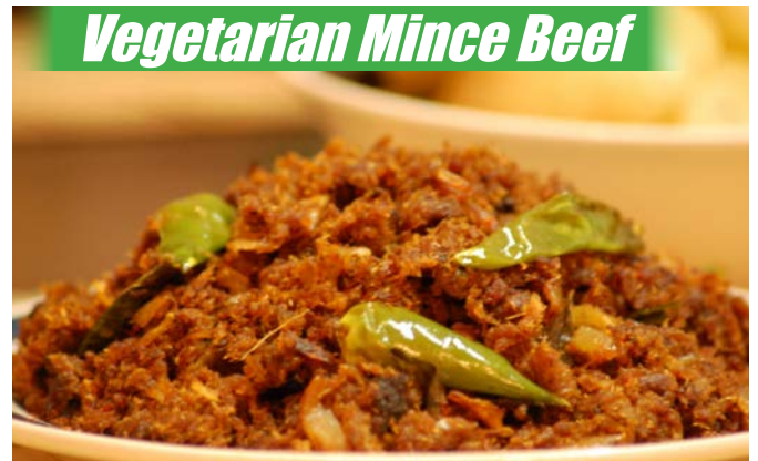
Vegetarian Mince Beef