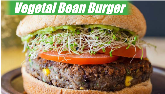
Vegetal Bean Burger